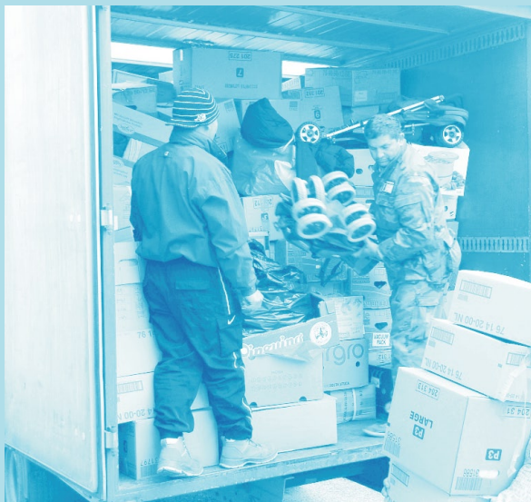
Acceptance of shipment in Lenartov