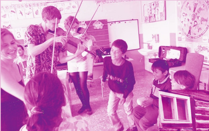
Musical workshop dedicated to Roma children from Roma settlement in Lenartov

Workshops were held on 6th August in the Roma settlement near Lenartov and on 7th August in the Roma settlement near Raslavice.