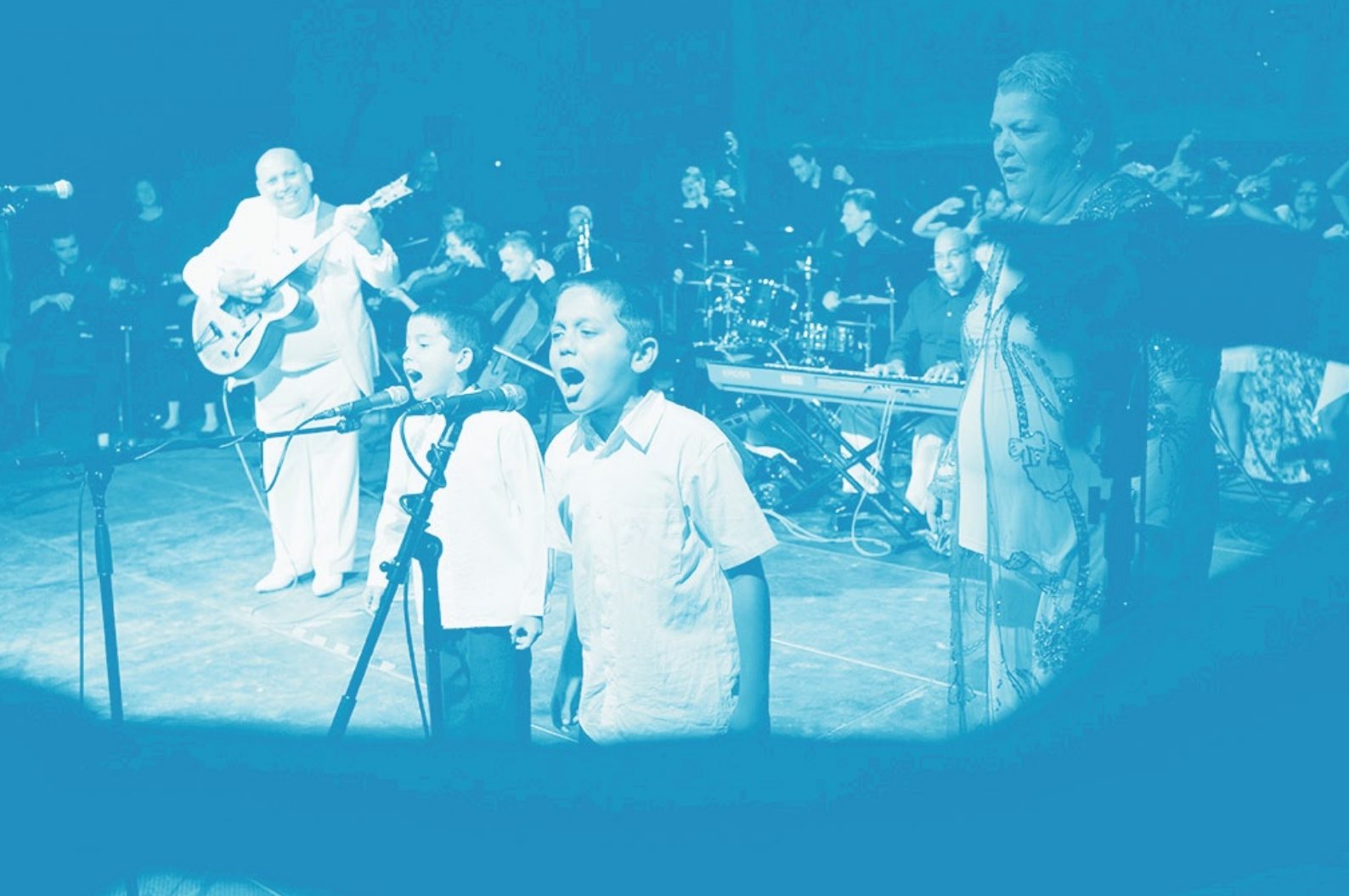
Concert in Roma settlement in Lenartov