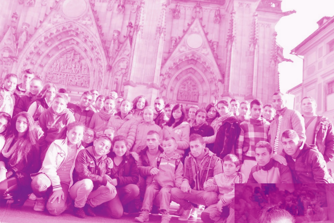
Members of the choir before Čhavorenge St. Vitus Cathedral. Vitus