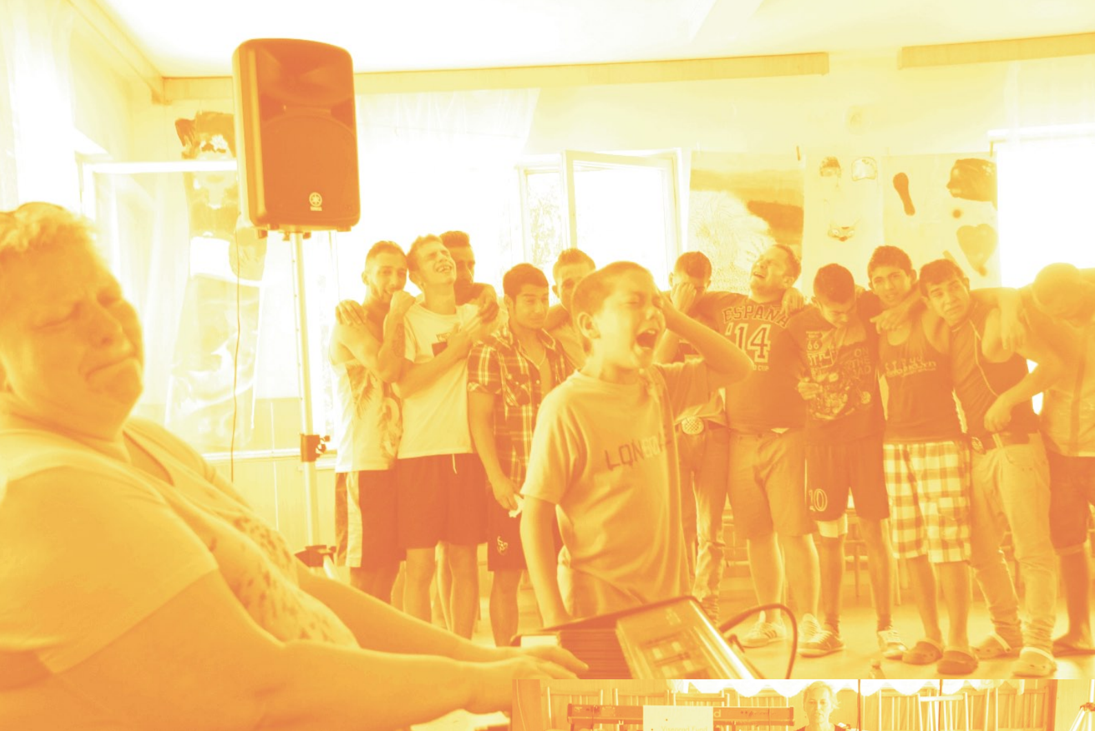
Joj – mamó expressional singing exercise