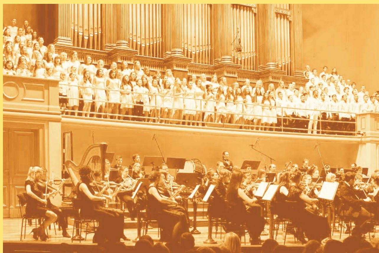
Čhavorence and the others student choirs accompanied by Czech student philharmonic