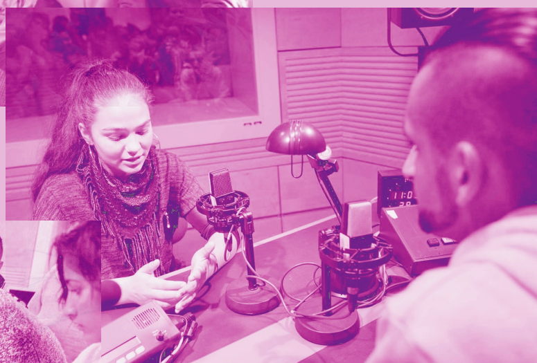
Members of choir Čhavorenge tried interview each other in Czech Radio, © Archive o. s. Miret