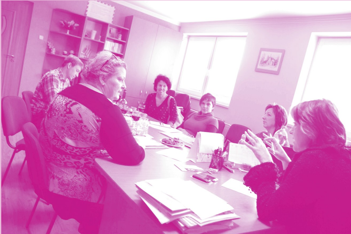
A meeting with mayors, Lenartov

18th – 20th February 2014 A meeting and collaboration on a Romano drom project took place with mayors of the villages where there are adjoining Roma settlements: Lenartov, Raslavice and Liptovský Mikuláš in the Slovak Republic.