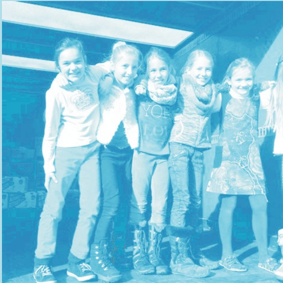
Collection of clothes – children from Montessori Zentru in Ludesch