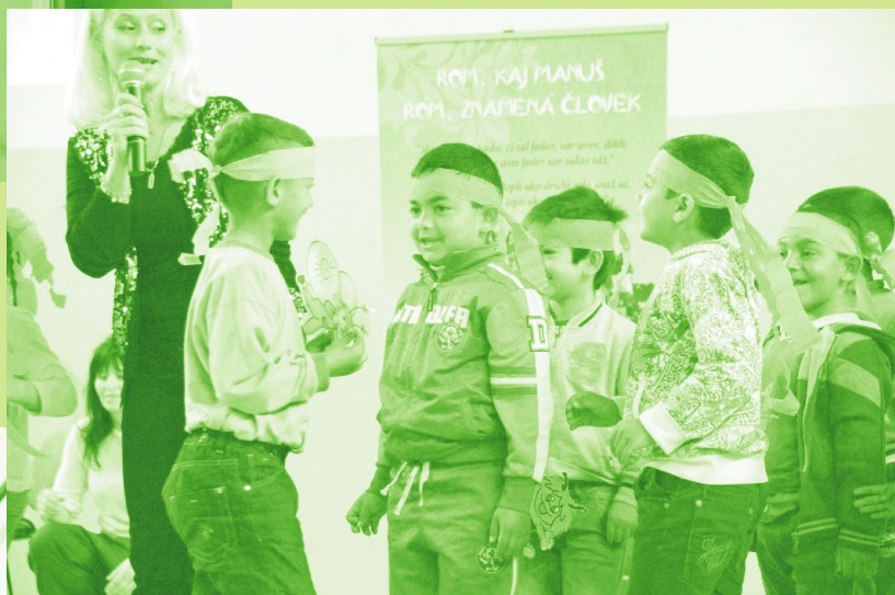
School Dr. A. Stodolu in Liptovský Mikuláš