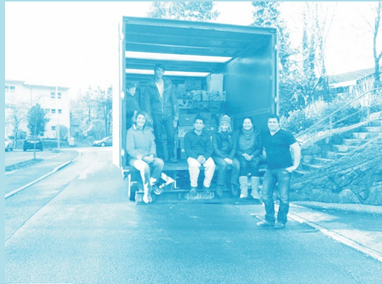
Parents of pupils of Montessori school in Ludesch