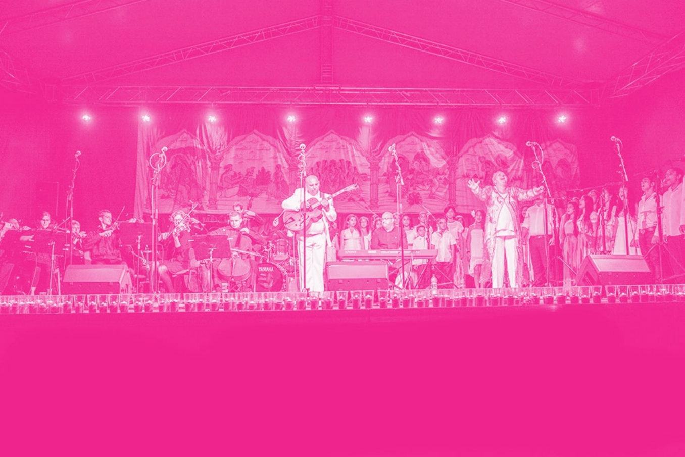
Concert in Roma settlement in Raslavice