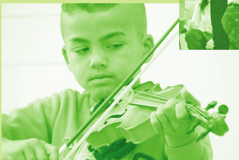
Artistic schiik in Bardejov, Slovakia