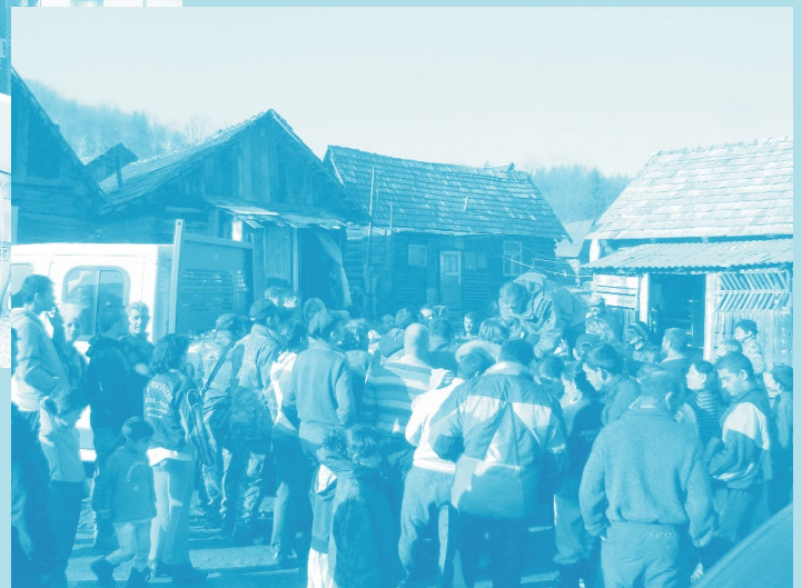
Receiving the consignment in the Roma settlement in Lenartov